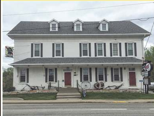
Big Al Capone's, present day.